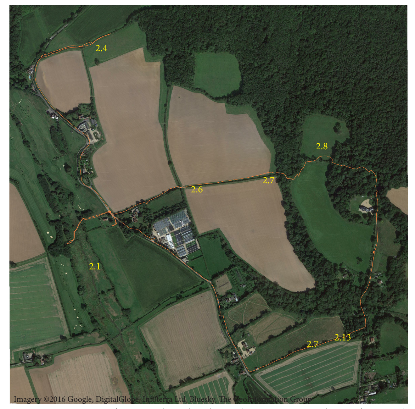
Map 1. 2016 Survey route for Binstead parish and major locations mentioned in text (para. nos.).

edge of their range. As the Cinnabar Moth feeds on Ragwort it was promoted as a counter to the 'pull it up everywhere' (very poor control management for ragwort) brigade. One man's meat.... What the actual situation is with The Cinnabar (which is an effective control agent itself) is much less clear. See http://www.ragwort.org.uk/ for a fairly dispassionate look at Ragwort.