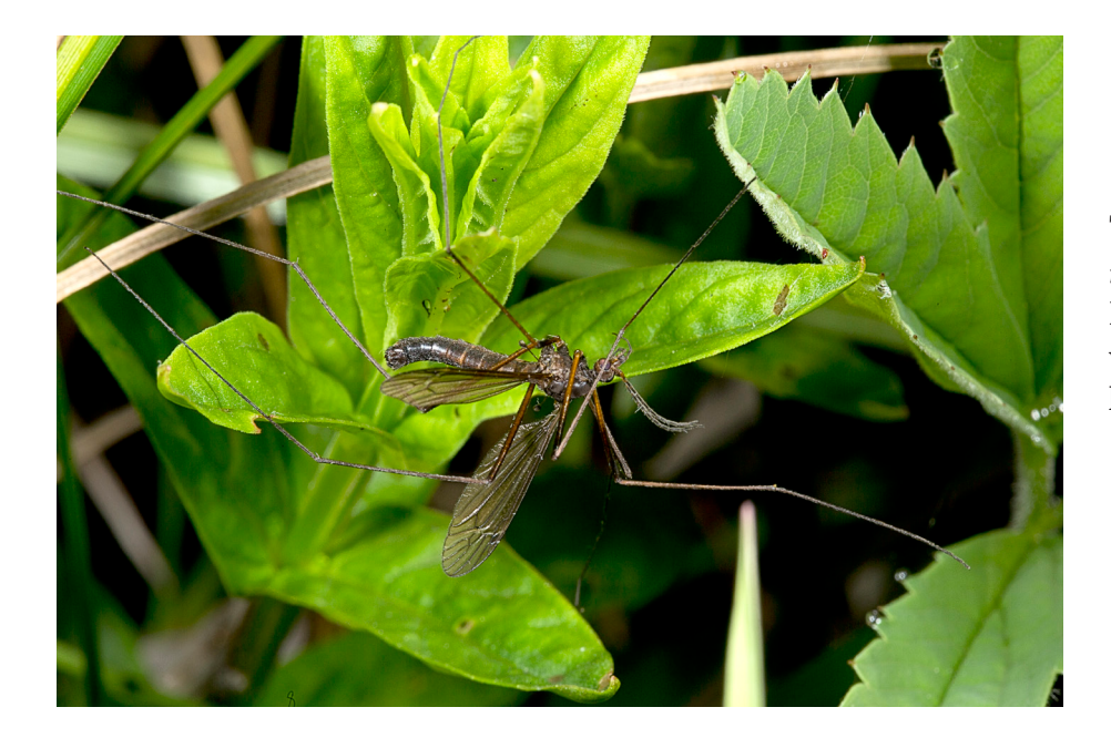
The cranefly Tipula nigrotipula, recorded at Binsted Rife, is associated with wet peat, a scarce habitat in West Sussex.